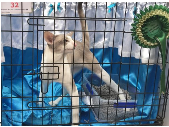
Siamese Owner Evelyn Kueh (photo attached)