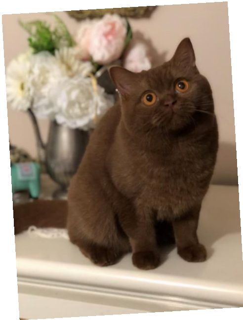
CatsWA reserve Group 3 Female kitten, Furdinkum Diamonds R Forever