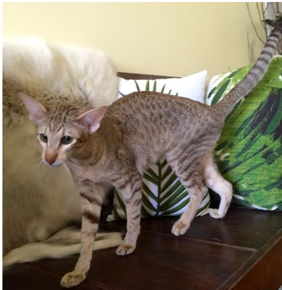
Oriental Owner Evelyn Kueh (photo attached)